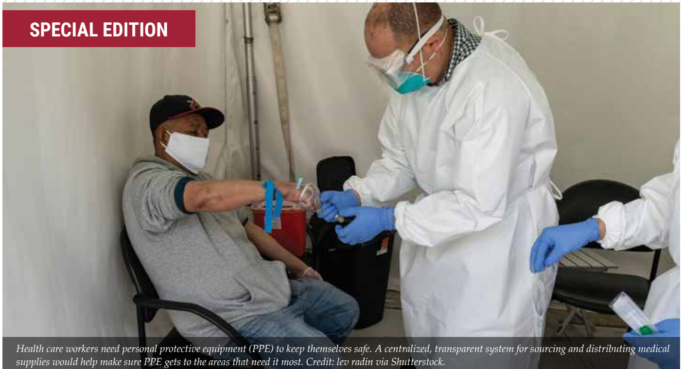
Health care workers need personal protective equipment (PPE) to keep themselves safe. A centralized, transparent system for sourcing and distributing medical supplies would help make sure PPE gets to the areas that need it most.