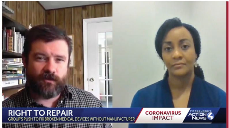
Pittsburgh's Action News 4

In March, as cases of COVID-19 mounted, it became vitally important that hospitals be able to return broken ventilators to service as quickly as possible. But, some manufacturers had restricted access to the repair documentation and service keys that biomedical repair technicians need to fix and maintain these lifesaving devices,