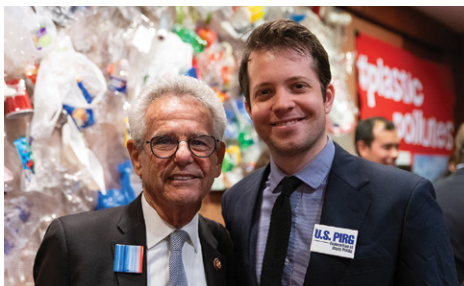
Alex Truelove and U.S. Rep. Alan Lowenthal applaud the introduction of sweeping plastic waste legislation.

On Feb. 11, U.S. Sen. Tom Udall and U.S. Rep. Alan Lowenthal introduced legislation that would re-envision how we handle our plastic waste. The first measure outlined in the proposed Break Free From Plastic Act is simple: make less of it. The legislation would phase out unnecessary single-use plastics, which overburden our landfills and pollute our environment. The legislation also provides funding for recycling and composting infrastructure, and would shift the financial burden of managing waste and recyclables from town and city governments to manufacturers.